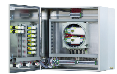
Explosionproof switchgear assembly for Zones 1 and 2 Ex db eb IIC T6 Gb