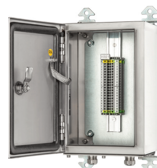
Explosionproof terminal box Ex eb IIC T6 Gb Ex tb IIIC T80°C Db