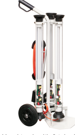
Hand truck with 3 tube lights (55 watts each) and cable reel with 15 m cable