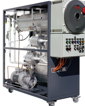
Explosionsproof compact heat transfer unit