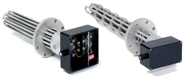
Explosiosproof heating units type GLX for liquids and gases Ex db eb IIC T1-T6 Gb